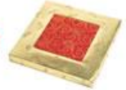
No. 140 Size : 10 x 10