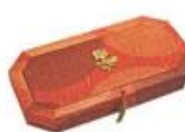
No. 197 Size : 9 x 17