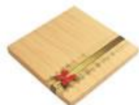
No. 139 Size : 12 x 12