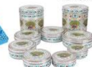
Stainless Steel Dabba available in all size (8 to 12)