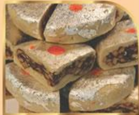
Kaju Anjir Cutlet