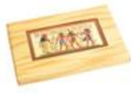
No. 105 Size : 10 x 15