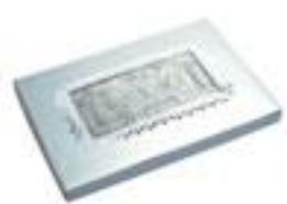
No. 100 Size : 10 x 15