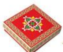
1 Pound &amp; 2 Pound Sweet Box